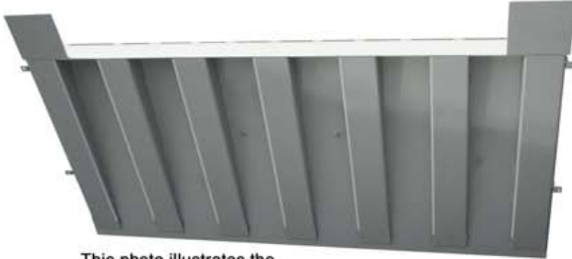
This photo illustrates the optional asphalt package ramp understructure.