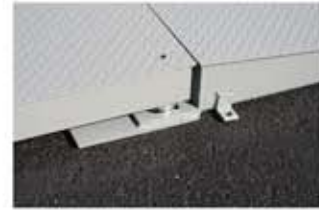
Optional ramp has an asphalt package and locator plates. The asphalt package supports the scale on asphalt and protects the scale from settling. The locator plate properly aligns the ramp and scale and supplies proper clearance for operation.